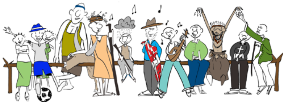
Above: Village characters in a boma peace committee in Paths to Peace.

At each payam visited and trained by the EF team, a peace trophy was presented to the payam administrator to symbolise that payam's acceptance of peace. The trophy remains with him until training moves to another location. The custodian of the trophy is invited to take part in the next payam training and presents it to his counterpart there. In this way, the peace project spreads the peace message and creates linkages between payams. Furthermore, medals are presented to members of the Peace Committees who proudly wear them to demonstrate their status as peace champions within their community.