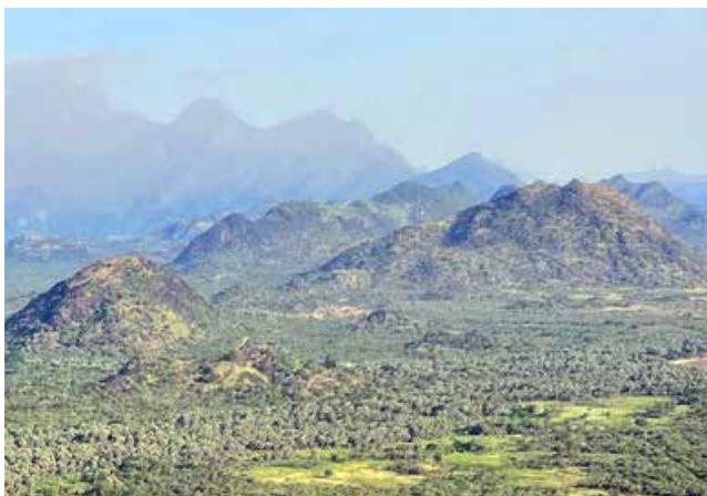
Aerial view of Kidepo Game Reserve

Kidepo Game Reserve features a breathtaking landscape of sand-bed rivers, inselbergs, mountains, bamboo thickets, and open savannas. It is the only semi-arid ecosystem protected in South Sudan. Despite poaching pressures and security challenges, KGR's intact habitats and the presence of wildlife both north of the reserve and in neighbouring Kidepo Valley National Park (Uganda), including elephants and giraffes, hold promises for future recovery. With proper protection and management, the reserve would play a critical role in both stability and the restoration of biodiversity across the Kidepo Valley Transboundary Ecosystem.