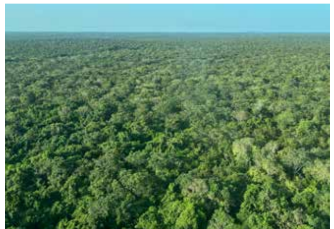
Aerial view of Lantoto National Park

Lantoto National Park forms a contiguous protected area with Garamba National Park in the Democratic Republic of Congo (DRC), sharing a 98 km porous border along the Congo-Nile watershed. Situated at the transition between the Sudan-Guinean savanna and the Congolese rainforest, LNP boasts a spectacular mosaic of wooded savannas, forests, and striking inselbergs. Its central hills and streams sustain key rivers, swamps, and lowlands that support local livelihoods. Given its exceptional, near-pristine scenery, LNP holds potential to restore and protect its unique assemblage of species, including chimpanzees, elephants and lions. A well-managed, secure park will strengthen both regional security and ecosystem integrity across the Lantoto-Garamba landscape.