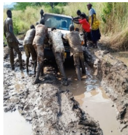
Above: The road to Losite.

Whilst assuming that the peace project will result in an improvement, insecurity remains an issue within the project area. Sadly, staff of our partner VSF/ G staff were robbed during a road ambush in Kimotong Payam.