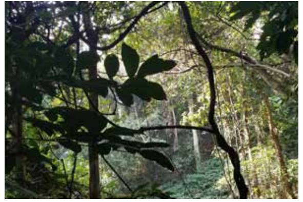
Above: Chimpanzee habitat in Lantoto

While our efforts under this pillar will officially begin in 2026, our team conducted a 25km reconnaissance walk inside the park and found exciting evidence of the presence of chimpanzees in the form of three nests.