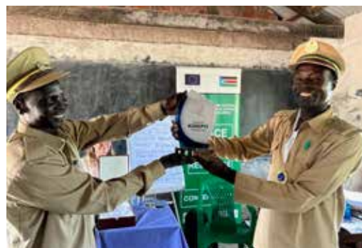
Above: Peace trophy presentation in Lotome Payam.

At each payam visited and trained by the EF team, a peace trophy was presented to the payam administrator to symbolise that payam's acceptance of peace. The trophy remains with him until training moves to another location. The custodian of the trophy is invited to take part in the next payam training and presents it to his counterpart there. In this way, the peace project spreads the peace message and creates linkages between payams. Furthermore, medals are presented to members of the Peace Committees who proudly wear them to demonstrate their status as peace champions within their community.