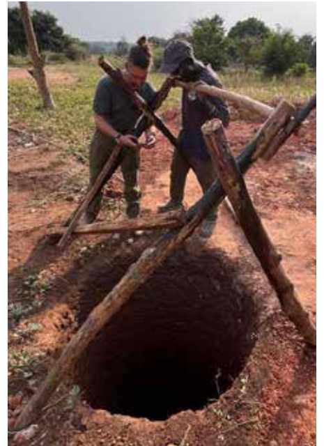
Right: Work underway on a borehole.

Enjojo Foundation has begun the development of a Community Conservation Manual to guide impending conservation education activities in Lantoto National Park and Kidepo Game Reserve.