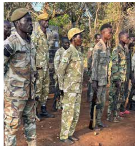
Right: Rangers in LNP.

Patrols were conducted at Buruduwa (4km from basecamp) and the old border crossing into DRC/Garamba.