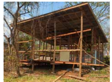
Above (from top) Laden with building materials, the Rasolo truck leaves Juba.